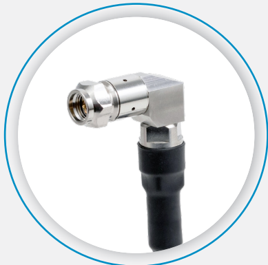
SMA2.9 Right-angle Plug

As a leader in civil aircraft interconnection and RF connectors, Radiall introduces a new innovative technology in response to market demands to eliminate locking wires. Radiall's Self-Lock RF connectors are the perfect solution to provide secure connection-facing vibrations experienced in aerospace applications.