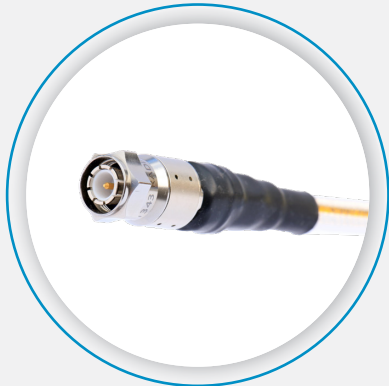
TNC Straight Plug