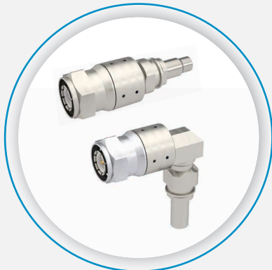
TNC Self-Lock TNC 18 Self-Lock