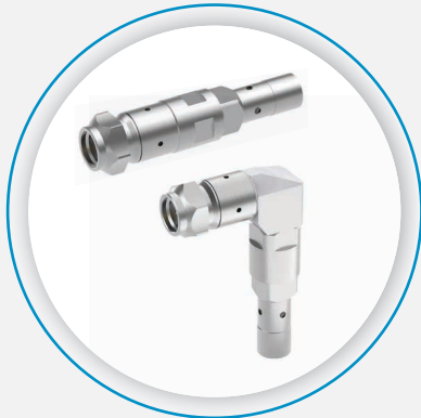
SMA 2.9 Self-Lock