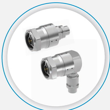
N 18 Self-Lock

As a leader in civil aircraft interconnection and RF connectors, Radiall introduces a new innovative technology in response to market demands to eliminate locking wires. Radiall's Self-Lock RF connectors are the perfect solution to provide secure connection-facing vibrations experienced in aerospace applications.