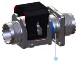
Part number starts with QFC