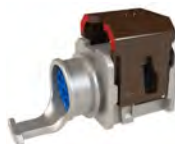
Banding platform and tie-wrap